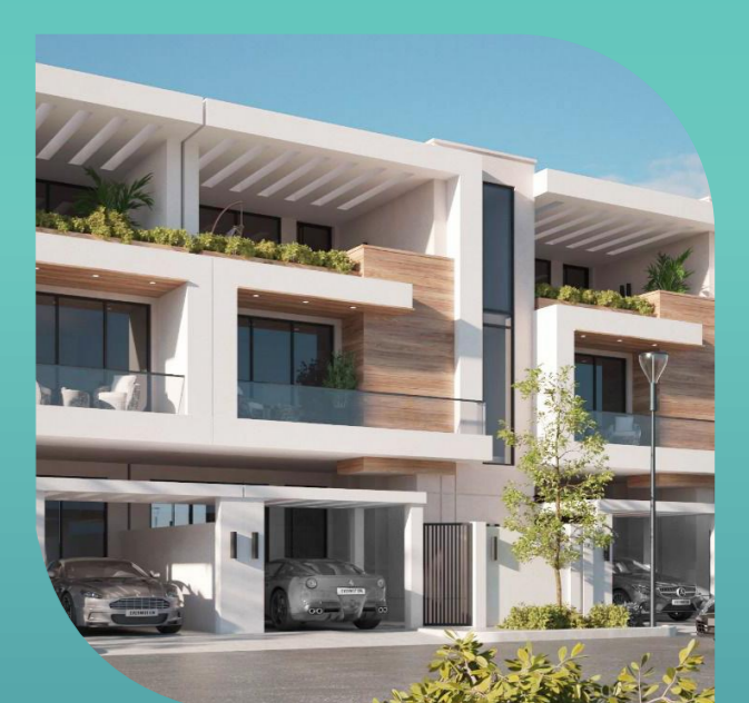
Town Houses Phase 1 & 2