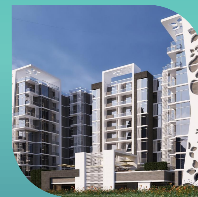
Al Wadi Building