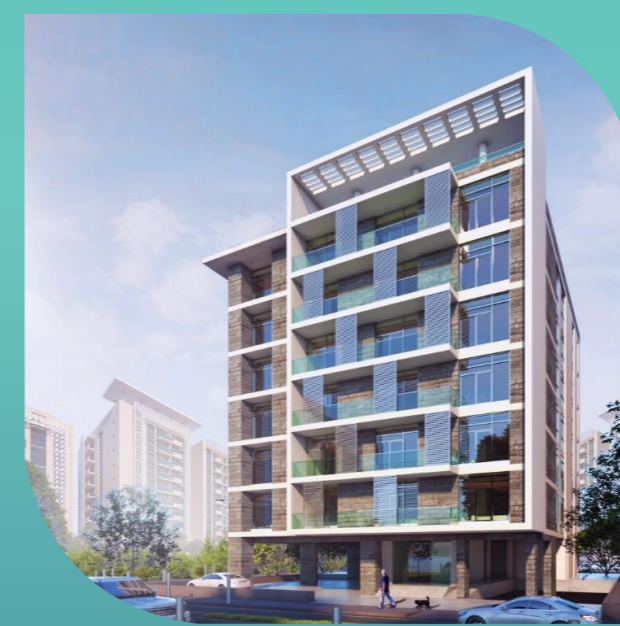
La Rose RA69 & RA70