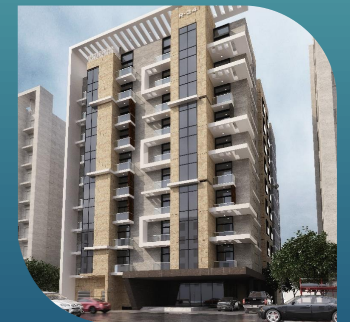
Al Erkyah R17 & R34