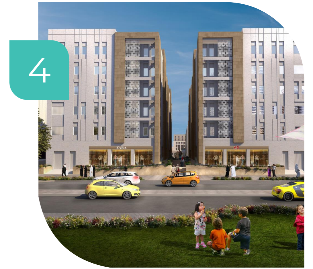
Al Dawoodia City