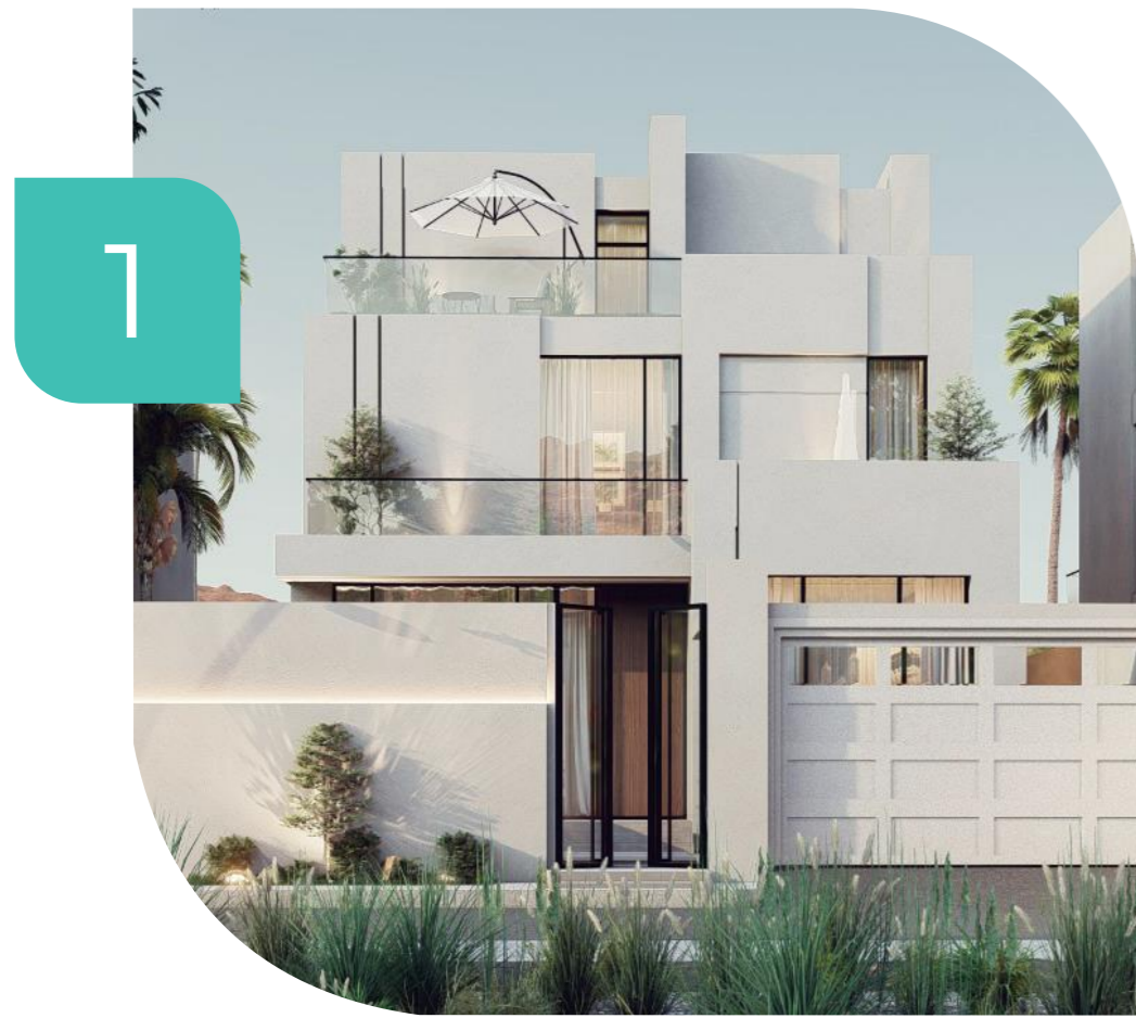
The Garden Villas Located in Thumama

Surrounded by two gardens to relax with the family, a mosque in the middle of the villa's master plan. Nearby commercial places that meet all your needs