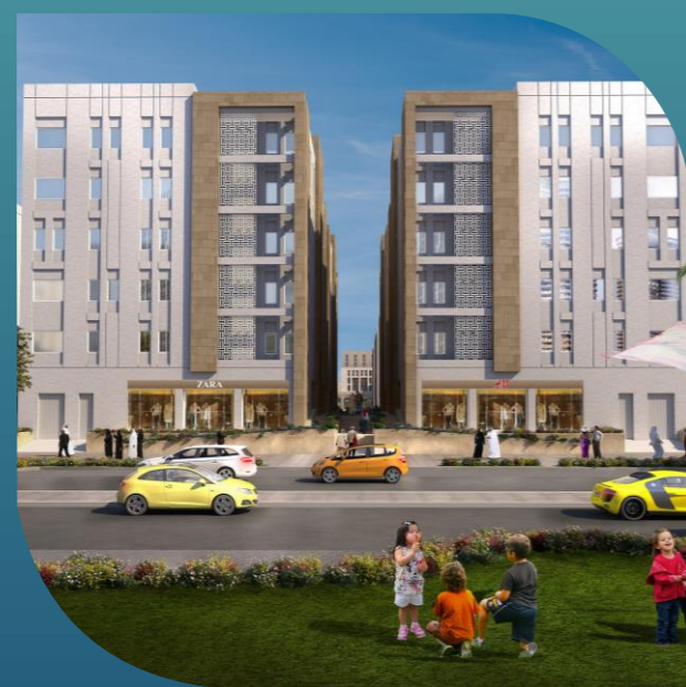
Al Dawoodia City