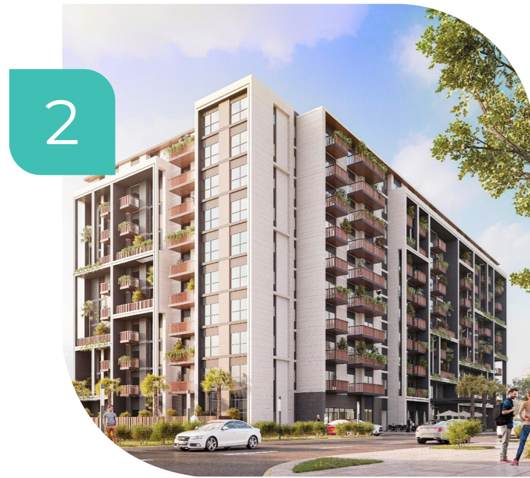
Al Orjuwan Building