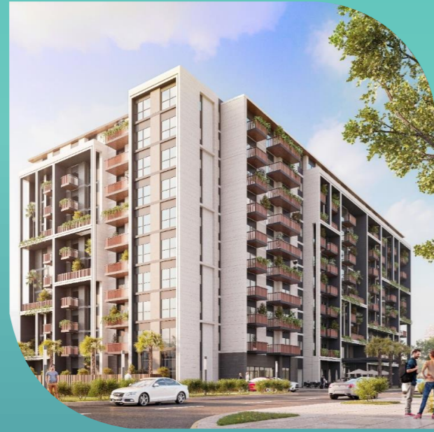
Al Orjuwan Building