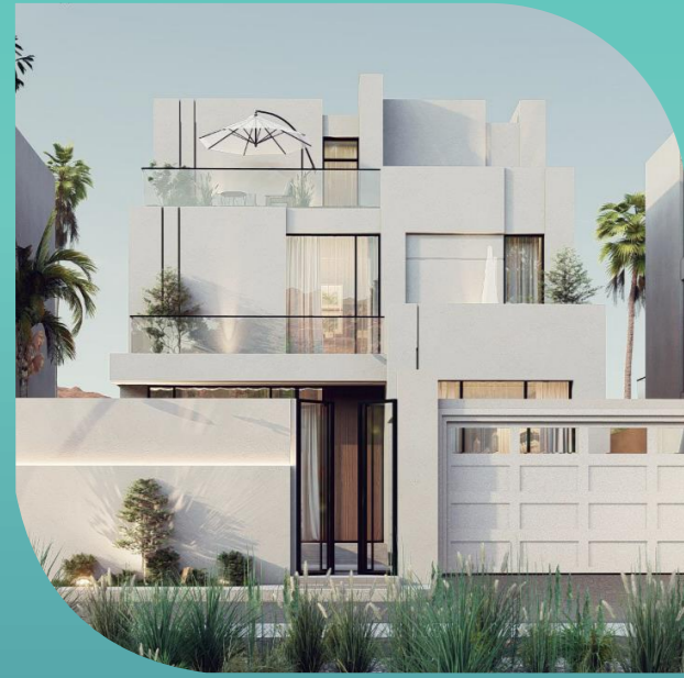
The Garden Villas